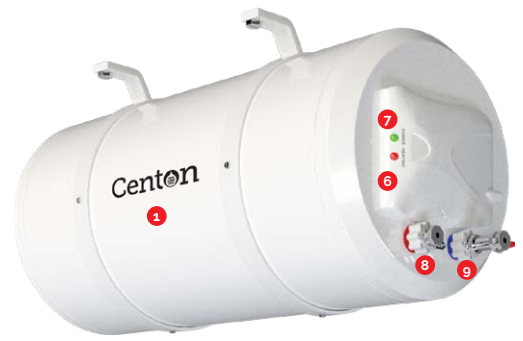
With O-Ring Bracket (50L)