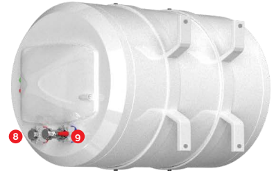
With O-Ring Bracket (30L)